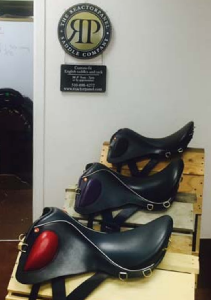
ReactorPanel Saddle Company.

bridle stores, with three different stories, have been created in the Lamorinda area to serve the robust equestrian community